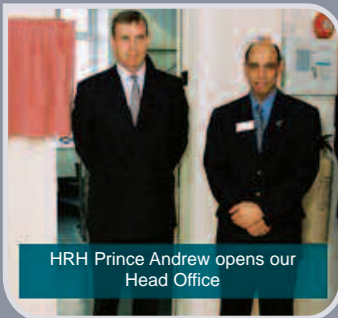
HRH Prince Andrew opens our Head Office