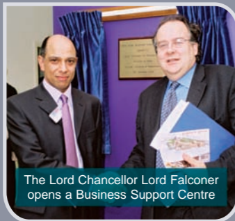
The Lord Chancellor Lord Falconer opens a Business Support Centre